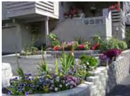
Summer flowers in the beautiful gardens

Reservations must be made 7 days in advance. Minimum reservation is for 3 nights; single or double nights approved on a "last minute" basis or unless 1-2 nights is all that is available. A reservation deposit of one night due 7 days after arranging reservation and 50% of the total if staying 5 or more nights, is due no later than ten (10) days prior to the reservation date. Reservation deposits by cashiers check, money order, personal check or credit cards are accepted. Balance is due upon arrival.